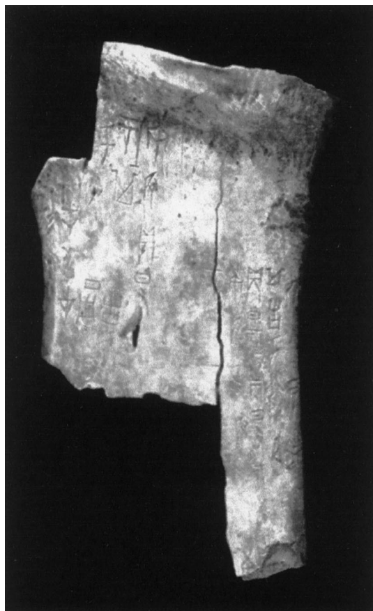
Fig. 1. Oracle bone with inscription. The top-left corner has been cut off for sampling, which was renovated later.

cient cities could be recognized as the capitals of Xia, Shang and Zhou dynasties. Lots of bronze artifacts of the Shang and Zhou dynasties were unearthed, too. Some bronze artifacts of late Shang and Zhou dynasties have inscriptions, which supplied another thread to study chronology.